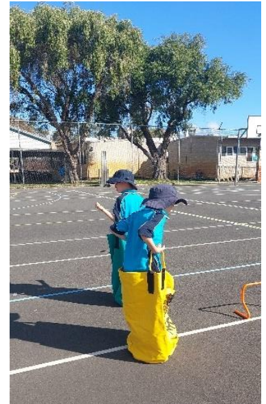
Sack race practice before the big event.

Room 19 students are currently working hard in all learning areas with everyone producing some outstanding work. Next Wednesday (20th September), we look forward to parents coming to visit during the learning journey between 3:00 and 4:30pm and having their children walk them through their learning experience thus far.