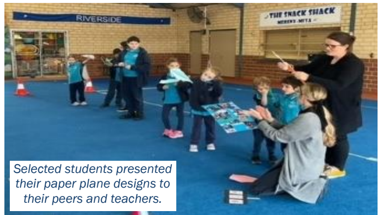
Selected students presented their paper plane designs to their peers and teachers.