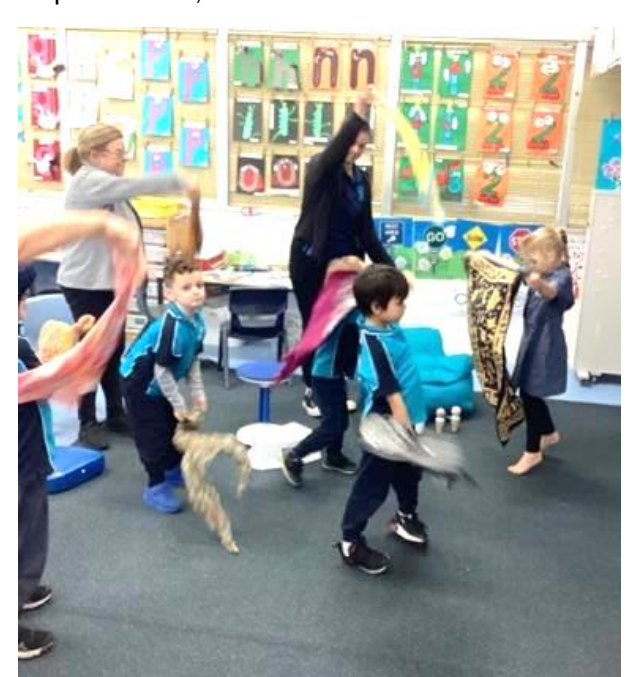
Room 35 students participating in their scarf dance. Keep up the beautiful work Room 35!