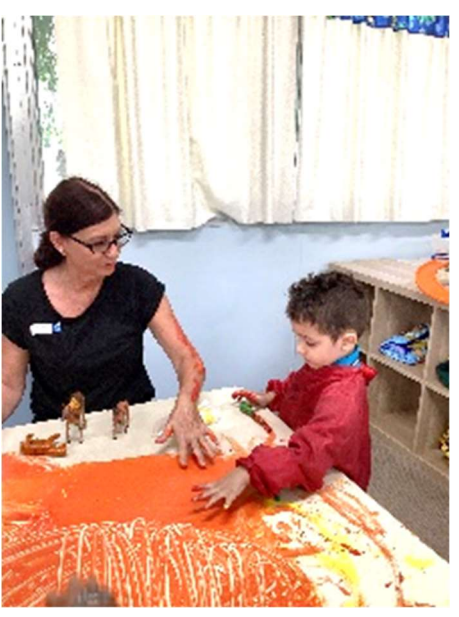
Sensory play with paint is so much fun!