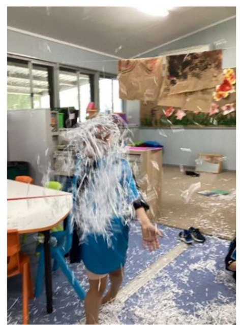
Throwing shredded paper is exciting!