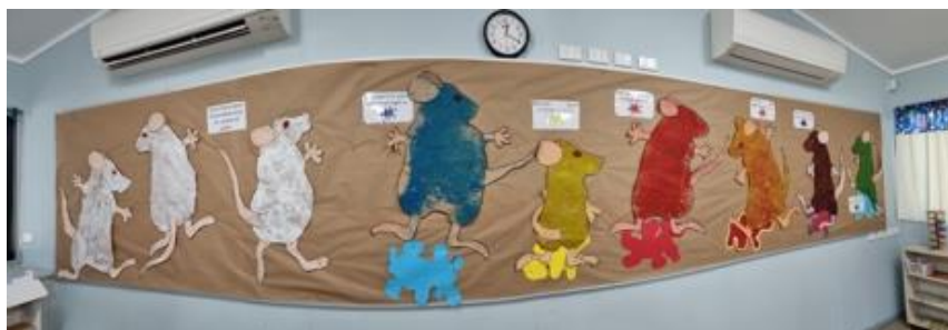
Our follow up activities to Ellen Walsh's picture book Mouse Paint resulted in the children producing this wonderful mural.

Due to our students' increased levels of joint engagement, we have been able to introduce a Story Time routine each day. Picture books are an essential part of our literacy program and we are so pleased to have reached this point. Thus far we have read The Blue Balloon by Mick Inkpen; Mouse Paint by Ellen Walsh; Rex Wrecks It! by Ben Clanton; and The Little Mouse, Red Ripe Strawberry and Big Hungry Bear by Don Wood.