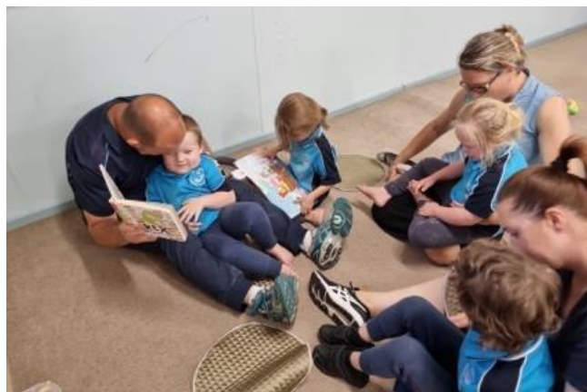
Our students are listening to Ben Clanton's picture book, Rex Wrecks It!

We look forward to increased levels of joint engagement so we can introduce other important elements to our classroom routine to support student learning.